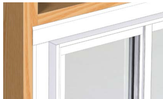
HALO Aquashield™ Integrated Window Flashing