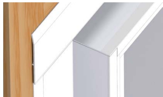
HALO Aquashield™ Integrated Window Flashing